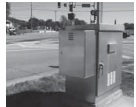
UPS unit and batteries in a piggyback cabinet; the design is suitable for retrofitting a signal cabinet for UPS equipment.