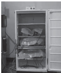
Monitoring and testing of UPS units at subfreezing temperatures in a freezer.