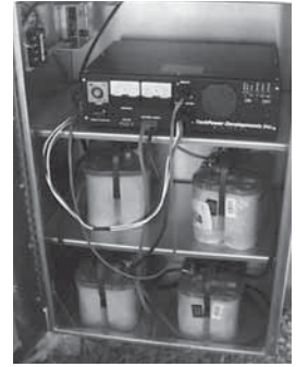
Installation of UPS in a separate, attached cabinet; the UPS unit is on the top shelf, and the batteries are on the middle and bottom shelves.