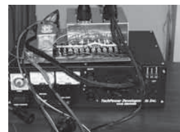
UPS units from two manufacturers undergo testing.