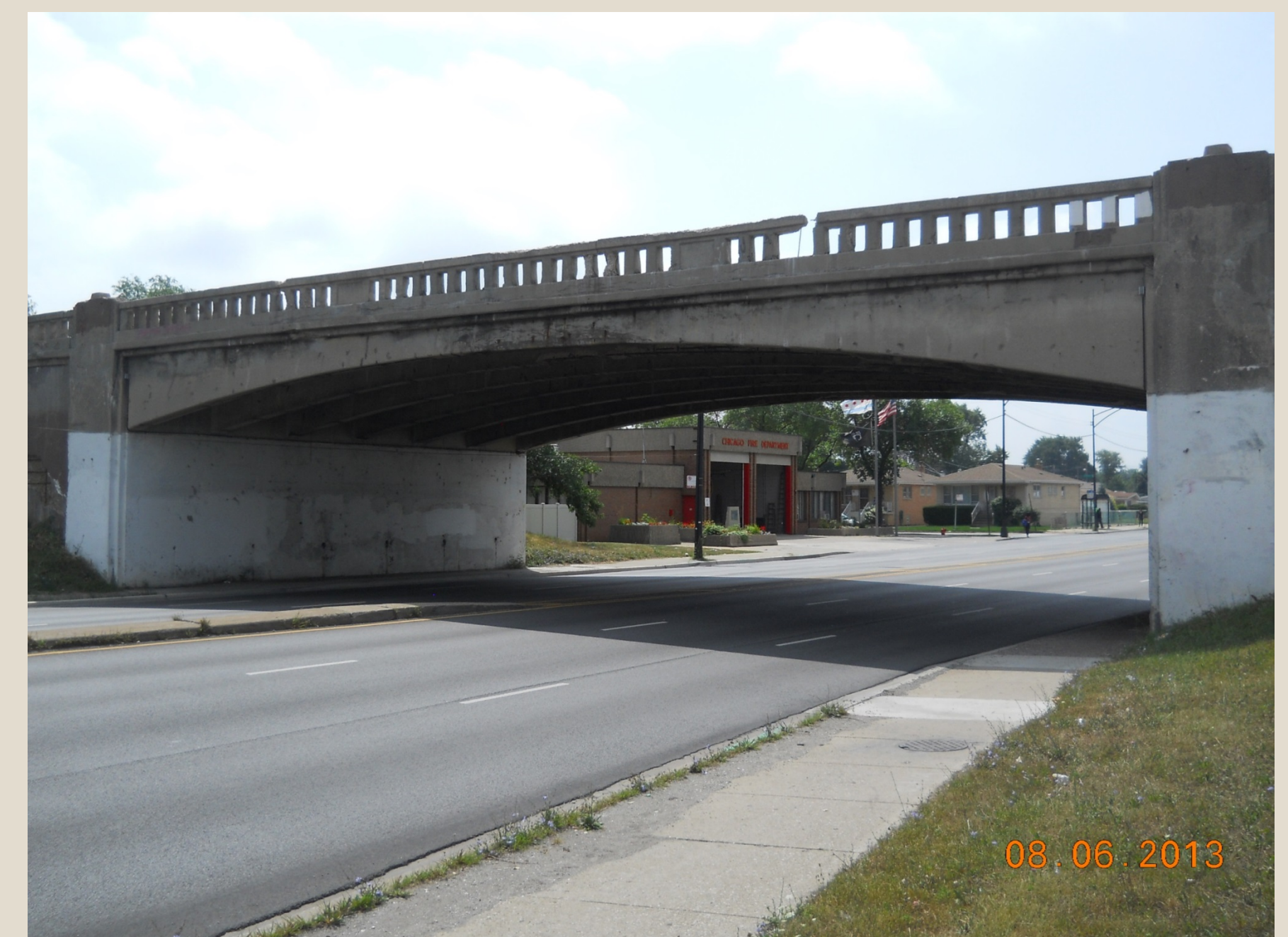
Existing Ford City Drive bridge/Pulaski Road with limited pedestrian accommodation