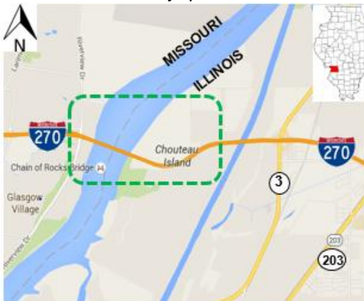
STUDY AREA OUTLINED IN GREEN

The meeting format is informal; no formal presentation will be made. Please browse the available materials at your leisure. Representatives of the Illinois Department of Transportation (IDOT), and IDOT's consultant teams, Horner & Shifrin and Parsons Transportation Group, and the Missouri Department of Transportation (MoDOT), are available to answer any questions.