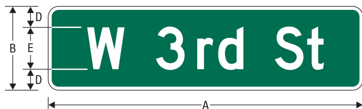
D3-1 STREET NAME SIGN