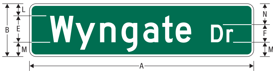
D3-1 – PRINCIPAL LEGEND WITH DESCENDING STROKES