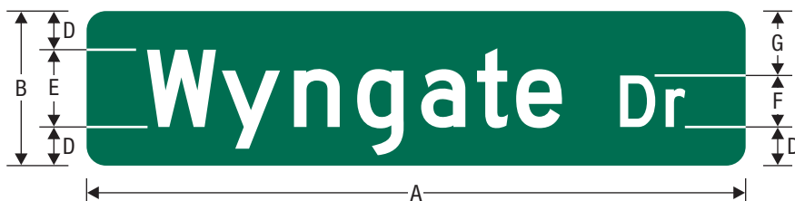
D3-1 – WITHOUT BORDER, PRINCIPAL LEGEND WITH OR WITHOUT DESCENDING STROKES