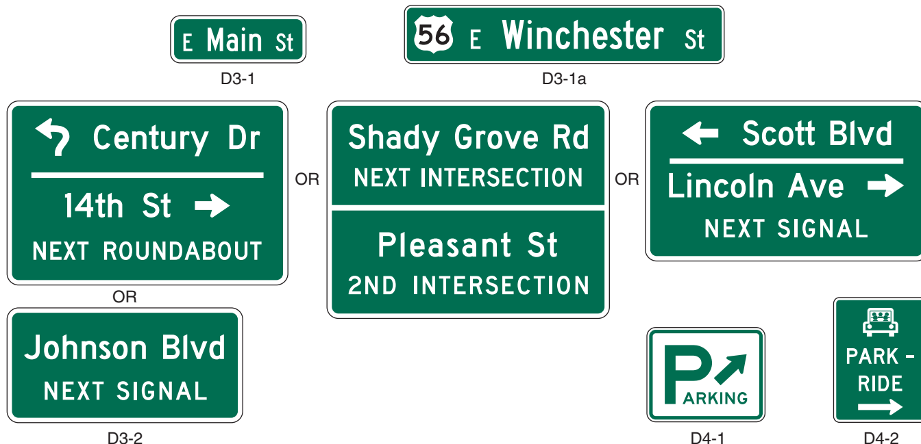
Figure 2D-10. Street Name and Parking Signs