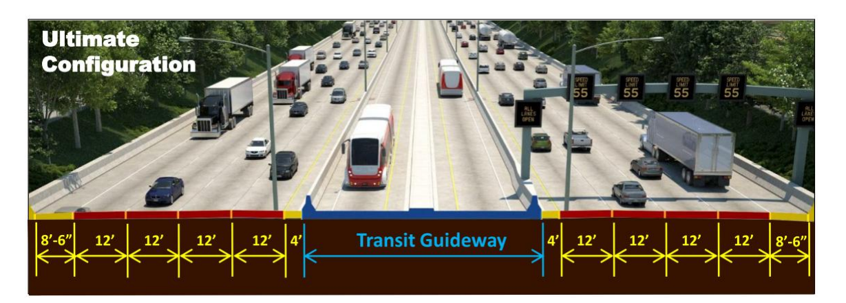
Figure 5-2. Convertible Expressway Section – Initial and Ultimate Configuration

As their names imply, each of the four build alternatives accommodates improvements to the existing HCT, the CTA Blue Line where it exists today, and provides for a westward expansion of HCT to Mannheim Road. West of the CTA Forest Park Terminal, an extension of HCT can be accommodated in the median of the expressway. Staged construction of I-290 is assumed such that the reconstructed expressway and overhead bridges would be configured to accommodate a subsequent HCT extension within the median without the need to reconstruct the expressway or overhead bridges. Figure 5-2 illustrates this staged approach, which utilizes an expressway typical section configured for future conversion of the inside lanes to HCT.