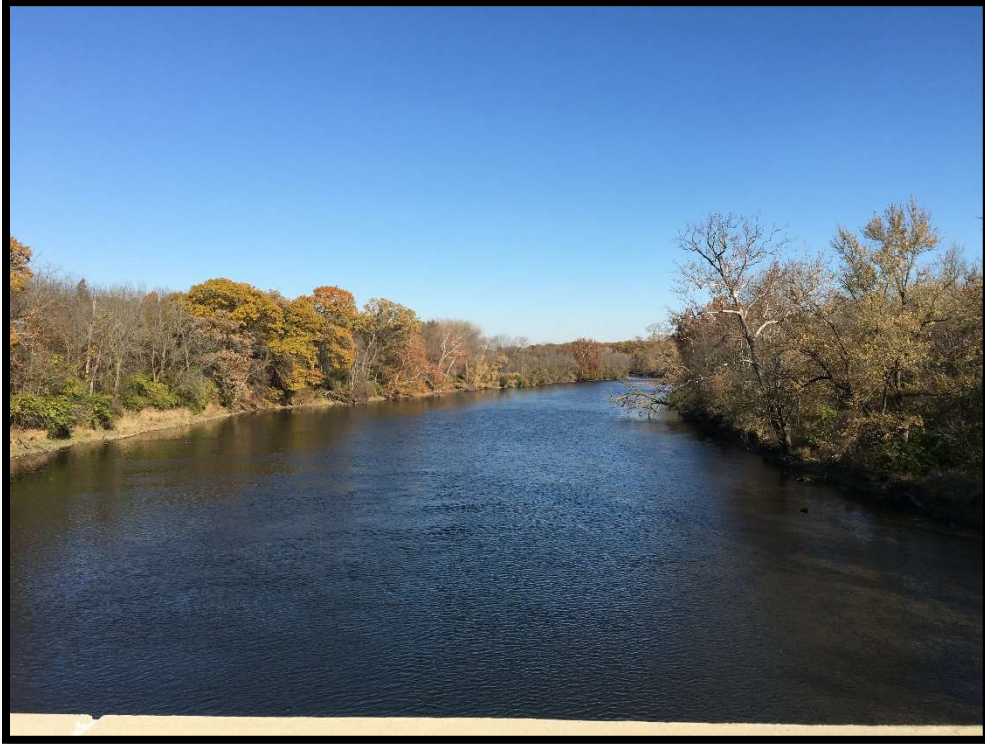
Looking North (on the bridge)