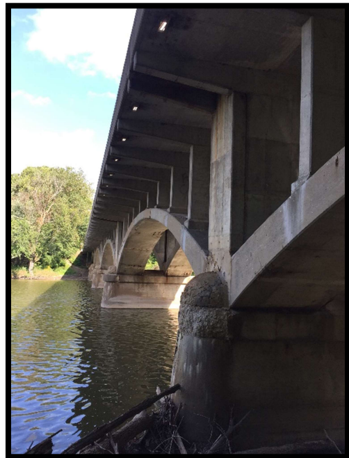
Underneath Looking East (from West Bank of Fox River)