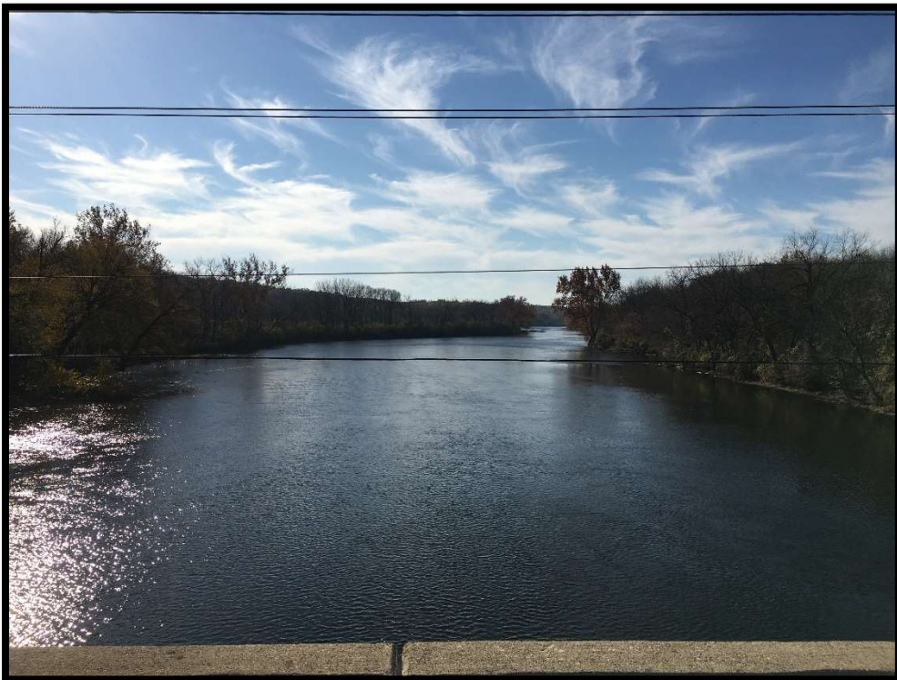
Looking South (on the bridge)