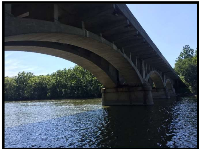
Underneath Looking West (from East Bank of Fox River)