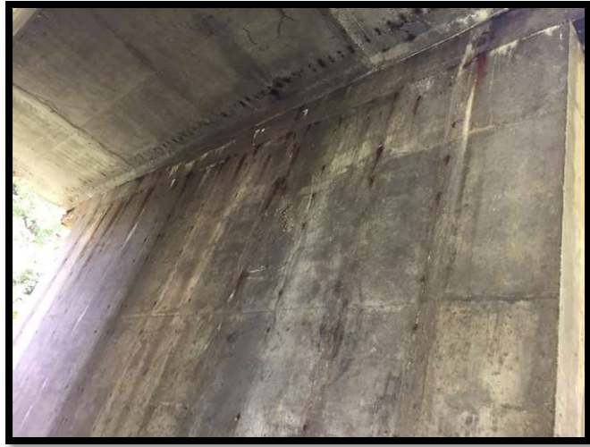
Underneath the Deck at West Abutment