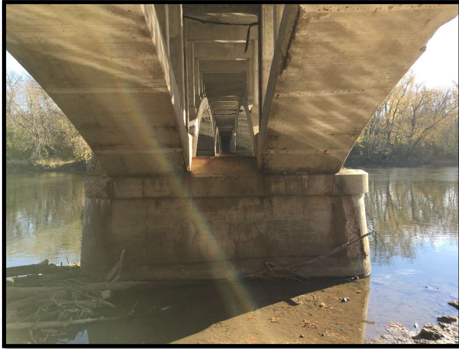
Reinforced Concrete Open Spandrel Arch on Solid Pier #1