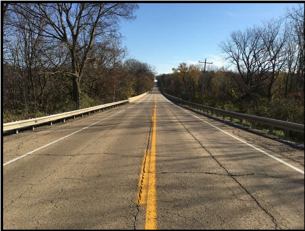
Looking East (West Approach)