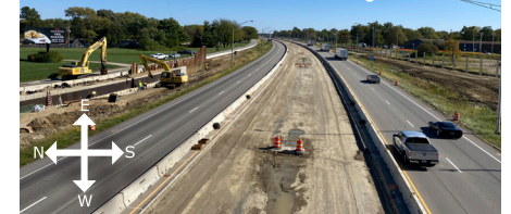
East view from Mattis Avenue bridge over I-74

SOUTH: Support posts are being installed for a noise wall. Another noise wall will go along the north side of I-74 (between Anthony Drive and I-74). Both noise walls will run from Mattis Avenue to west of Prospect Avenue. In the median, drainage work is completed and cement-modified dirt has been added to prepare for paving. NORTH: At Anthony Drive, east of Mattis Avenue, a permanent retaining wall is being installed.