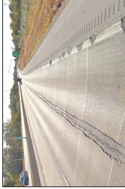
EXISTING LANE JOINT