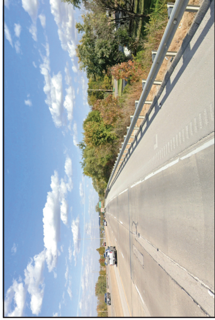
EXISTING NB PAVEMENT