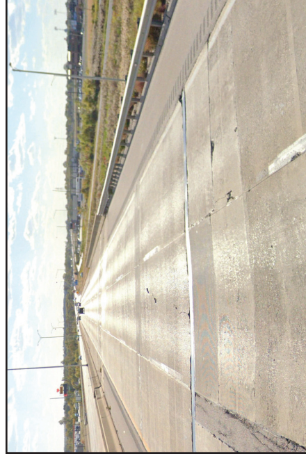
EXISTING BRIDGE APPROACH