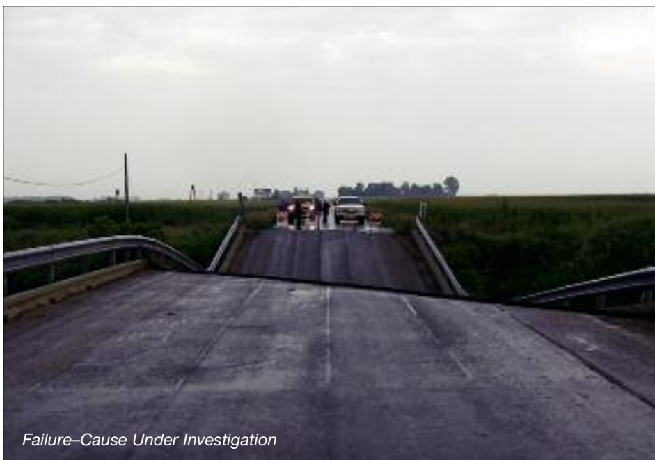
Failure—Cause Under Investigation

The PM not only ensures the NBIS inspections are performed, but also that they are performed correctly and at the appropriate intervals, and that