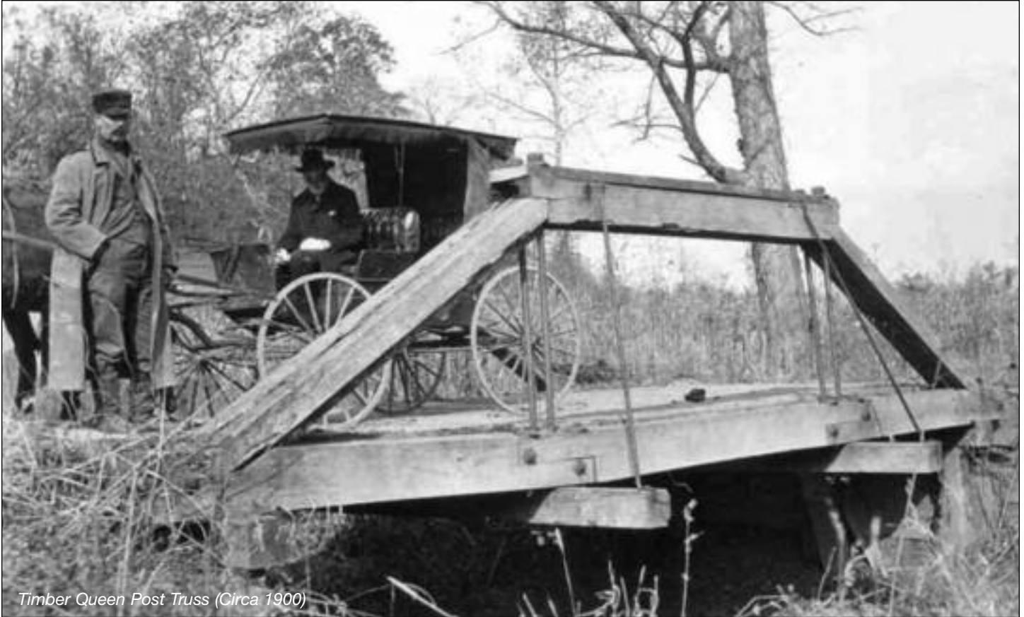
Timber Queen Post Truss (Circa 1900)

Continued from page 9 future maintenance and repair of the bridge. As an alternative to retaining responsibility for the HBS structure, the original owner-agency may, with the concurrence of the IDOT and the IHPA, transfer ownership and future responsibilities to another reputable agency or organization. The agency or organization with future repair and maintenance responsibility does not need to provide ready access to the HBS structure, designated parking areas for visitors, or signs to inform the public of the historical significance of the bridge. However, the responsible agency or organization must make the HBS structure available for viewing, when contacted by interested parties.