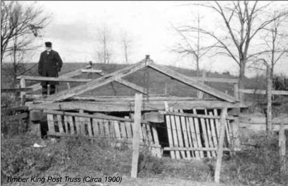
Timber King Post Truss (Circa 1900)