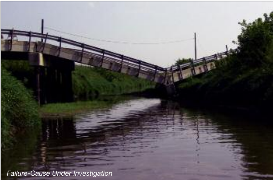
Failure-Cause Under Investigation