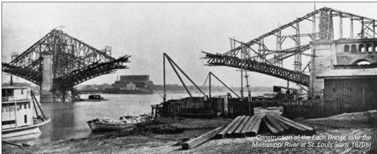
Construction of the Eads Bridge over the Mississippi River at St. Louis (early 1870's)

Although the procedures established for processing a project affecting a structure on the HBS may sometimes require additional time for project development, it is important to remember that, of the more than 27,000 bridges serving Illinois roadways, only the 379 structures presently on the HBS require additional coordination due to historic significance. Also, as described in this article, it can be seen that the procedures used by the IDOT do not preclude an agency from developing a project in a manner that best addresses highway needs. The established procedures only require agencies to give due consideration to the preservation of structures on the HBS and, if preservation is not possible, that proper documentation of the structure is accomplished prior to removal. As we can all agree that the past should not stand in the way of progress that will benefit society as a whole, we can also agree that taking the time to preserve reminders of our heritage and the efforts of those who came before us has great merit.