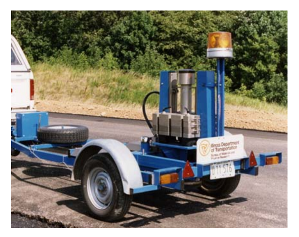
Figure 1: Falling Weight Deflectometer

The Falling Weight Deflectometer (FWD), shown in Figure 1, is a non-destructive pavement loading device capable of exerting a load impulse similar in magnitude and duration to moving truck and aircraft wheel loads.